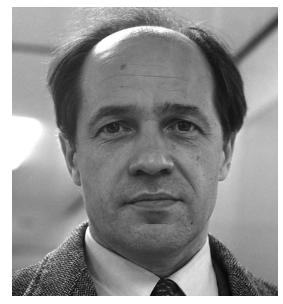
Born March 26, 1925, in Montbrison, France