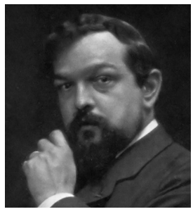
Rorn August 22, 1862, in Saint-Germain-en-Laye, France