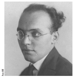
Born March 2, 1900, in Dessau, Germany

Brecht and Weill had already collaborated on the Mahagonny-Songspiel in 1927, a "scenic cantata" made up songs connected by orchestral passages. "Alabama Song" ("Show me the way to the next whiskey bar/ Oh don't ask why/ Oh don't