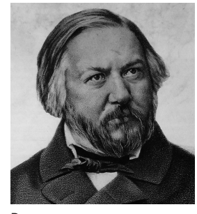
Born June 1, 1804, in Novospasskoye, Russia

The shortcomings of its plot notwithstanding, Ruslan and Lyudmila contains much brilliant music, and its overture has long been a popular concert piece. Glinka wrote this prelude after completing the rest of the opera, composing it, he recalled in his autobiography, between rehearsals for the first production. The energetic initial theme, with its rocketing scale passages, derives from the opera's last scene; the broader and more lyrical second subject is that of Ruslan's big aria in the second act. Glinka's colorful orchestration enlivens the entire work, and the accelerated coda that closes the piece makes for an exciting conclusion.