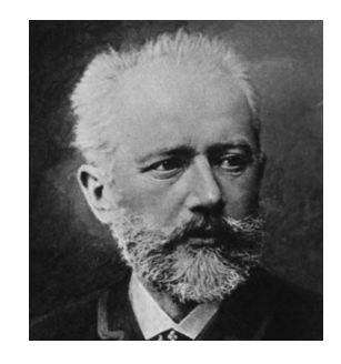
Born May 7, 1840, in Kamsko-Votinsk, Russia

Although this is vague and incomplete, there is little need for further programmatic details.