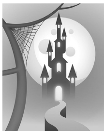
Thrills & Chills

LISZT Prometheus MOZART Piano Concerto No. 23, K. 488 BRAHMS Piano Quartet in G minor