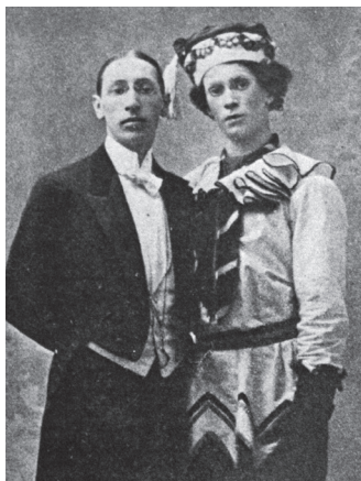
Igor Stravinsky with Vaclav Nijinsky as Petrushka

If these concerts have inspired you to learn more, here are suggested source materials with which to continue your explorations.